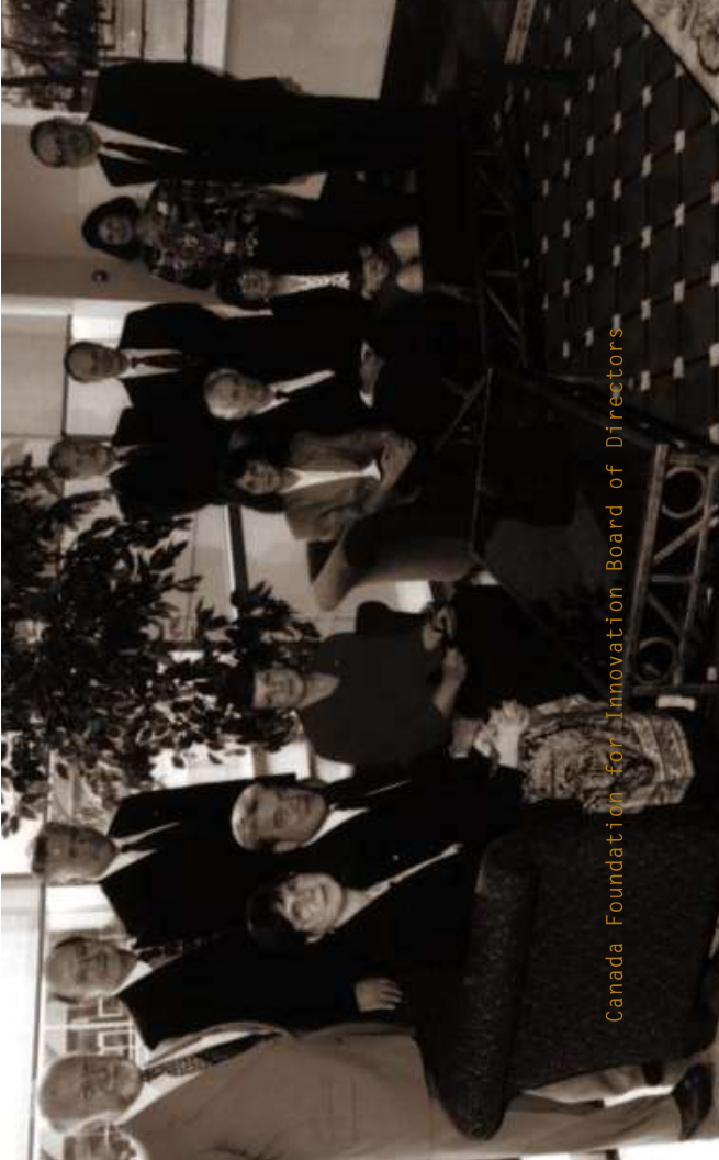
Canada Foundation for Innovation Board of Directors